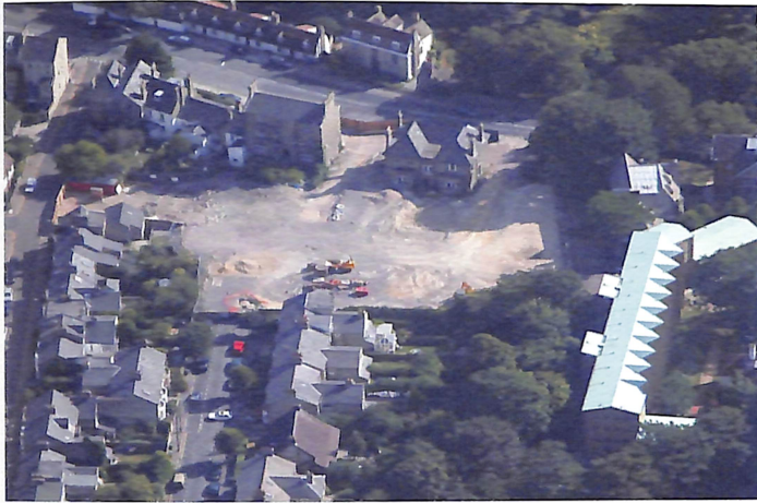
Demolition: October 2003