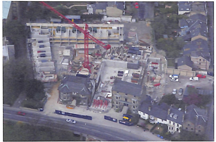
Construction: April 2004