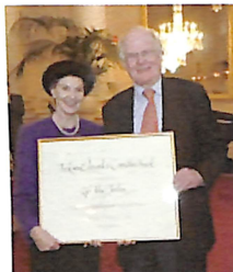
Sir John Tooley receives his award from Dame Antoinette Sibley