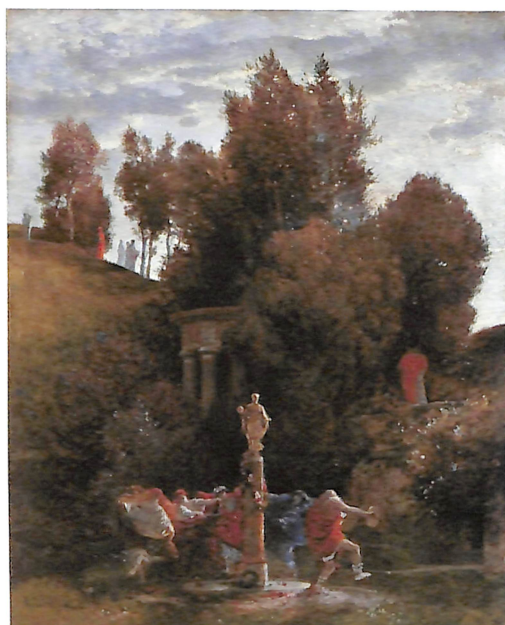
Arnold Böcklin: Roman May Festivals

It is May and a stroll through the College Courts serves notice that a reluctant Spring is at last upon us. For the majority of junior members, the faint but ever more insistent whiff of examinations is in the air; whilst for those whose biological clocks have at long last registered an end to such anxieties, the scent borne on the warming breeze is that of reunions: a bio-historical synergy of renewal and remembrance: à la recherche du temps perdu . As I write, we are about to welcome “home” for lunch some of our oldest members (1948-1952) whilst in September the reunion dinners will see the return of the mere whipper-snappers of 1979-1984.