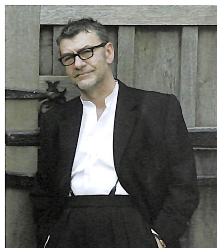
Jack Vettriano.

to which I would like to contribute." Jack has accepted Honorary Membership of the College which will be conferred in November when he comes to Cambridge.