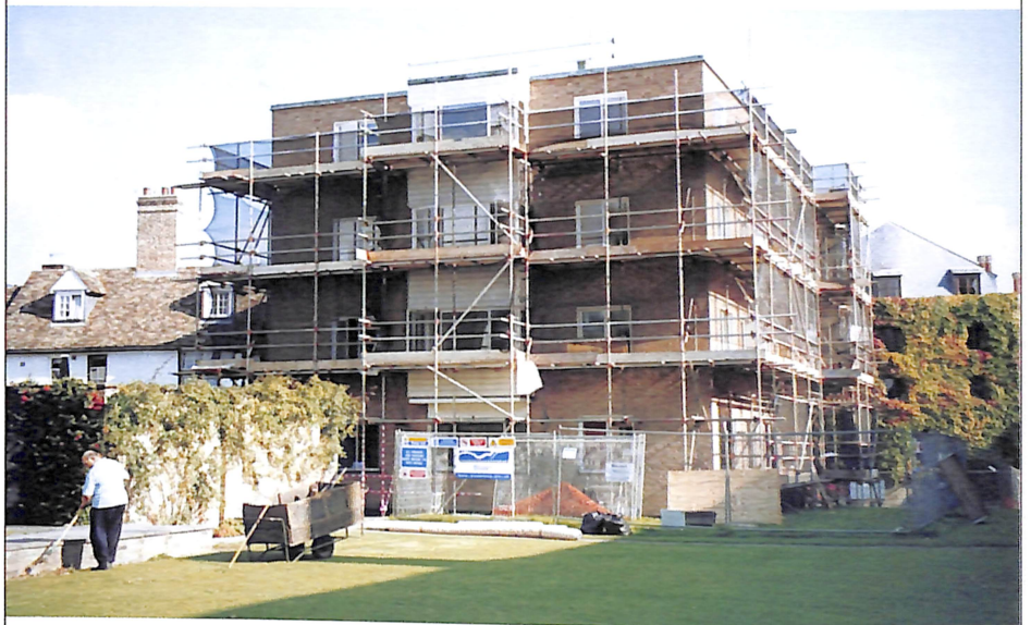
Building refurbishment work at 'O' Block in Benson Court

It is not just the College's ancient buildings that require care and attention. 'O' Block in Benson Court, which was built in the late 1950s, has recently undergone a major refurbishment programme and now offers some of the best accommodation in College. En-suite facilities have been fitted in all rooms, the windows have been double-glazed and high-grade new furniture has been installed. The result is 16 hotel quality rooms (including 2