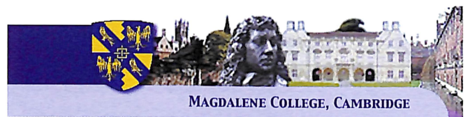
MAGDALENE COLLEGE, CAMBRIDGE