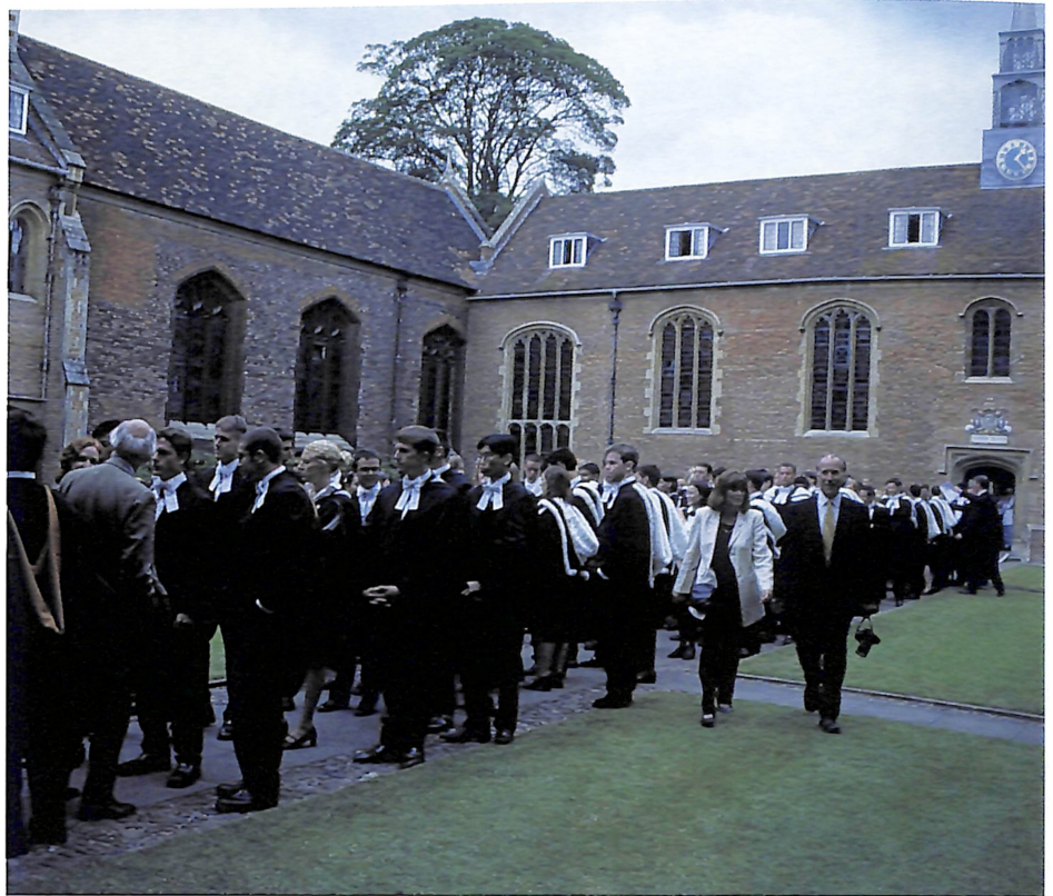
Graduating class of 2002