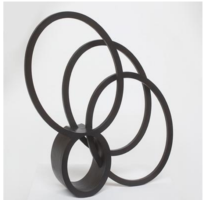
Southern Shade IV (60cm)', 2018, 60 x 55 x 10.7cm, Bronze

Nigel Hall RA is one of Britain's most distinguished sculptors. His outside works, principally made of corten steel, painted steel or bronze, are concerned with three-dimensional space, mass and line. His abstract and geometric sculptures give as much prominence to voids and shadows as to the solidity of material and each work changes with light and viewpoint reflecting the landscapes that inspired them.