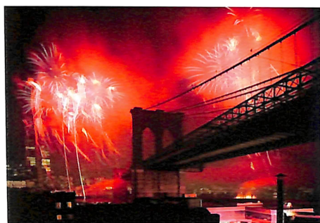
LAST YEAR'S MAM CELEBRATIONS

MAM, the College's North American alumnus organisation is set on a busy 2005-6 schedule with a series of meetings held both independently and in conjunction with Collegiate Cambridge's