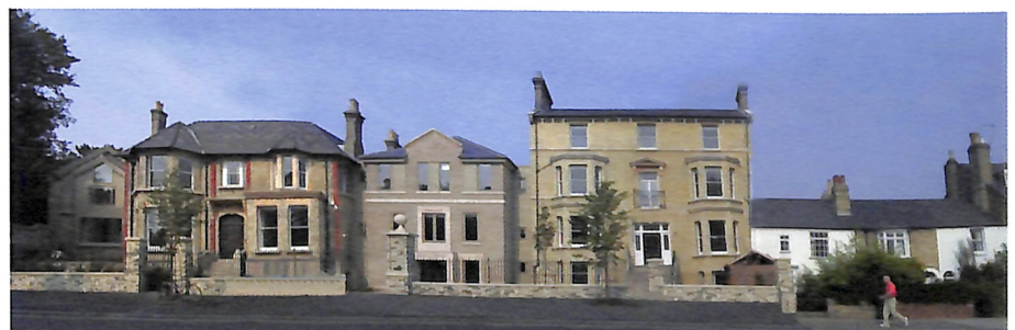
A MIRACULOUS TRANSFORMATION: FAÇADE OF THE NEW CRIPPS COURT

CRIPPS COURT was completed on time and on budget in the early summer. It will be officially opened on 30 November by HRH The Duke of Gloucester (1963). Its 42 splendid en suite rooms, Lecture Theatre, Gallery and seminar facilities are already transforming life in College and all are available for Conference use. Any member interested in knowing more about Conference and Event bookings should contact the conference office on: 01223 332138 or conferences@magd.cam.ac.uk