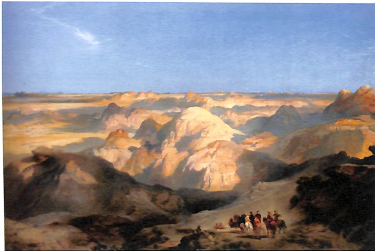
The Badlands of Dakota (1901) by Thomas Moran

Practically and most significantly this connection is experienced through the supervision system. In a sense, supervisions are a luxury: students interact in small numbers on an everyday basis with the most eminent of the University's senior faculty. In a sense, they are a privilege: the most extraordinary resources are put at the disposal of the freshest undergraduate. They cost money of course, and are – again in an objective sense – a serious drain on every college's endowment. But, as anyone who has experienced the unique benefits of supervisions knows, they are also a necessity: the heart of the Cambridge learning experience, the fons et origo of intellectual adventure and the single most precious feature of an educational programme which exists for no other purpose than to promote excellence.