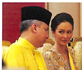
Raja Dr Nazrin Shah and Tuanku Zara Salim

Honorary Member Raja Dr Nazrin Shah , the Raja Muda of Perak married Ms Zara Salim Davidson on 17 May. Our warmest congratulations and best wishes go to them both. On 18 May Tuanku